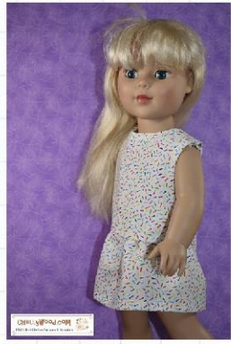
View A: Shirt with Lining