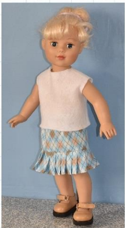
View B: Easy-sew Felt Shirt